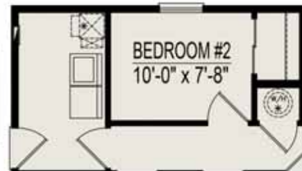
Crawl Space Plan