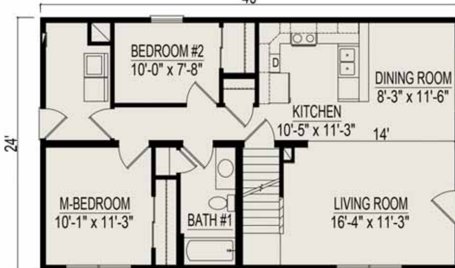
1st Floor Basement Plan